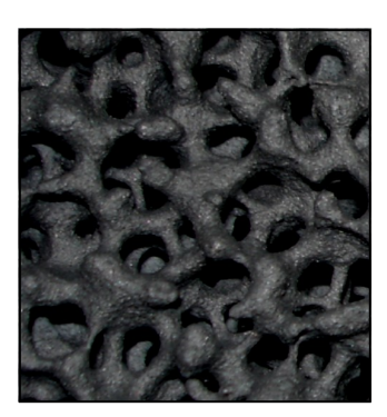
Filter Sleeves use advanced ceramic foam filters available for most metal types. Standard pore sizes include: